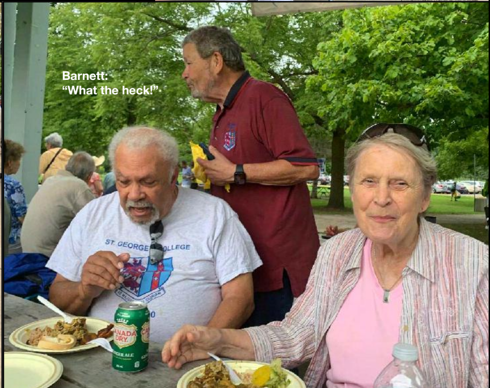
Barnett: "What the heck!"