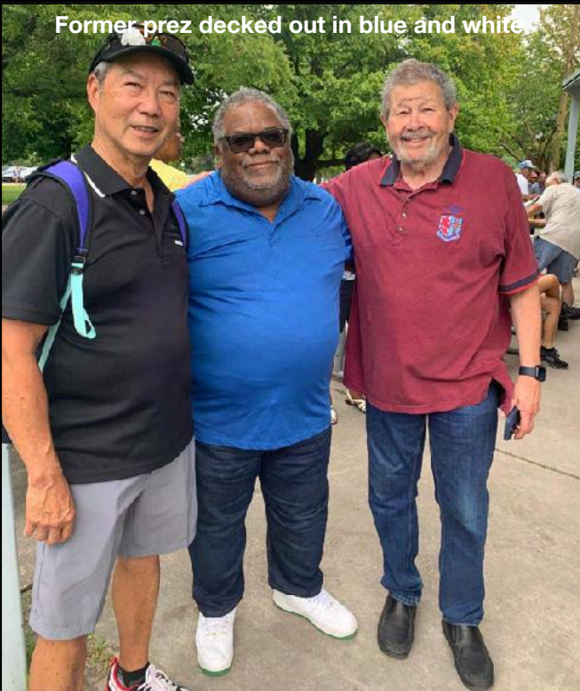
Former prez decked out in blue and white