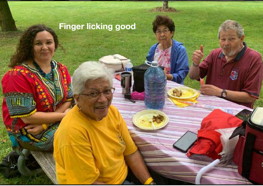
Finger licking good