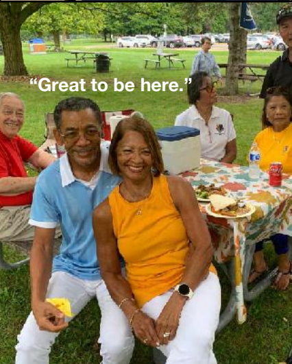
"Great to be here."