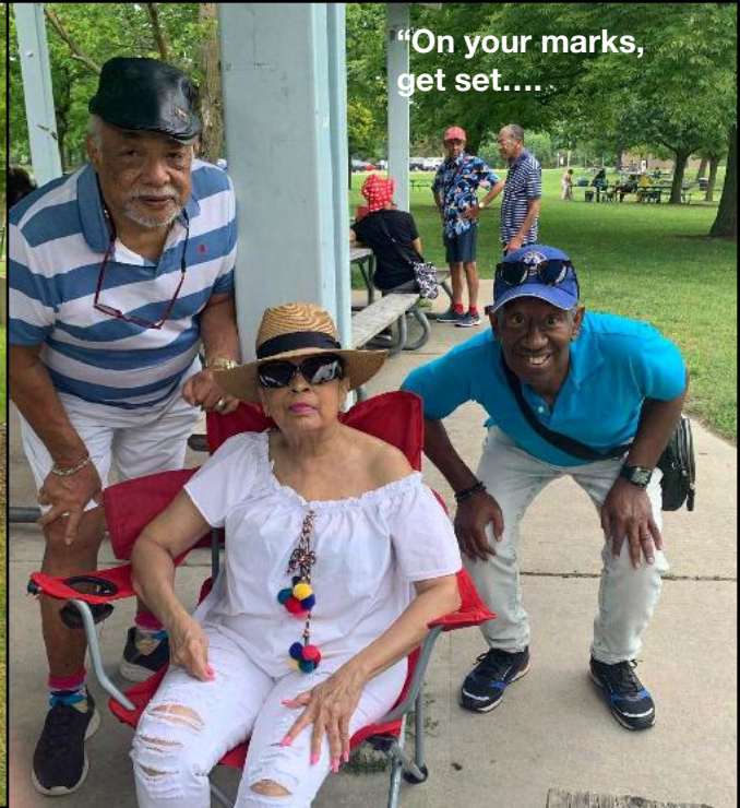
"On your marks, get set...."