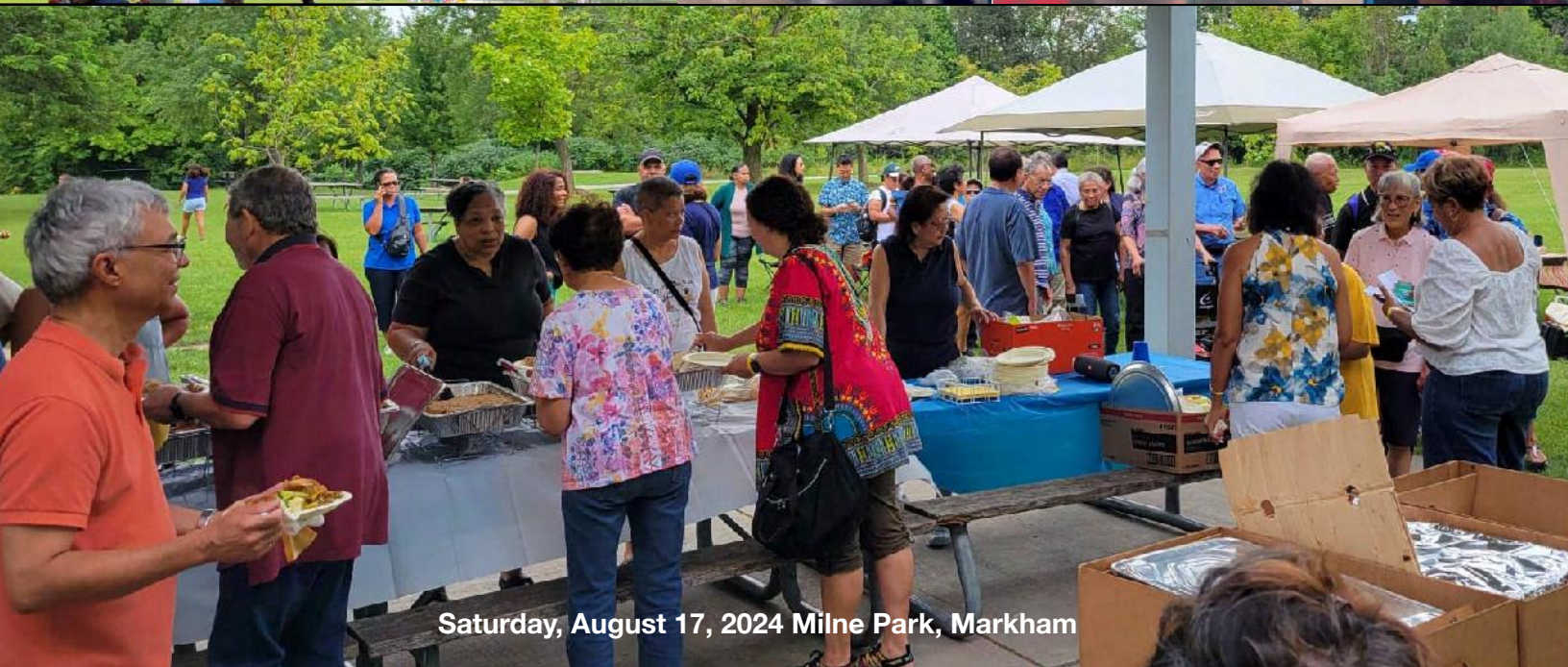
Saturday, August 17, 2024 Milne Park, Markham