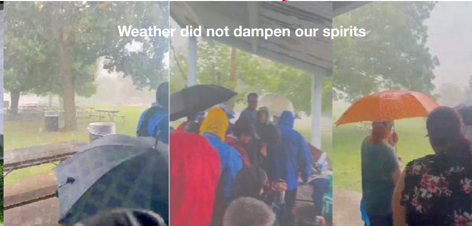
Weather did not dampen our spirits