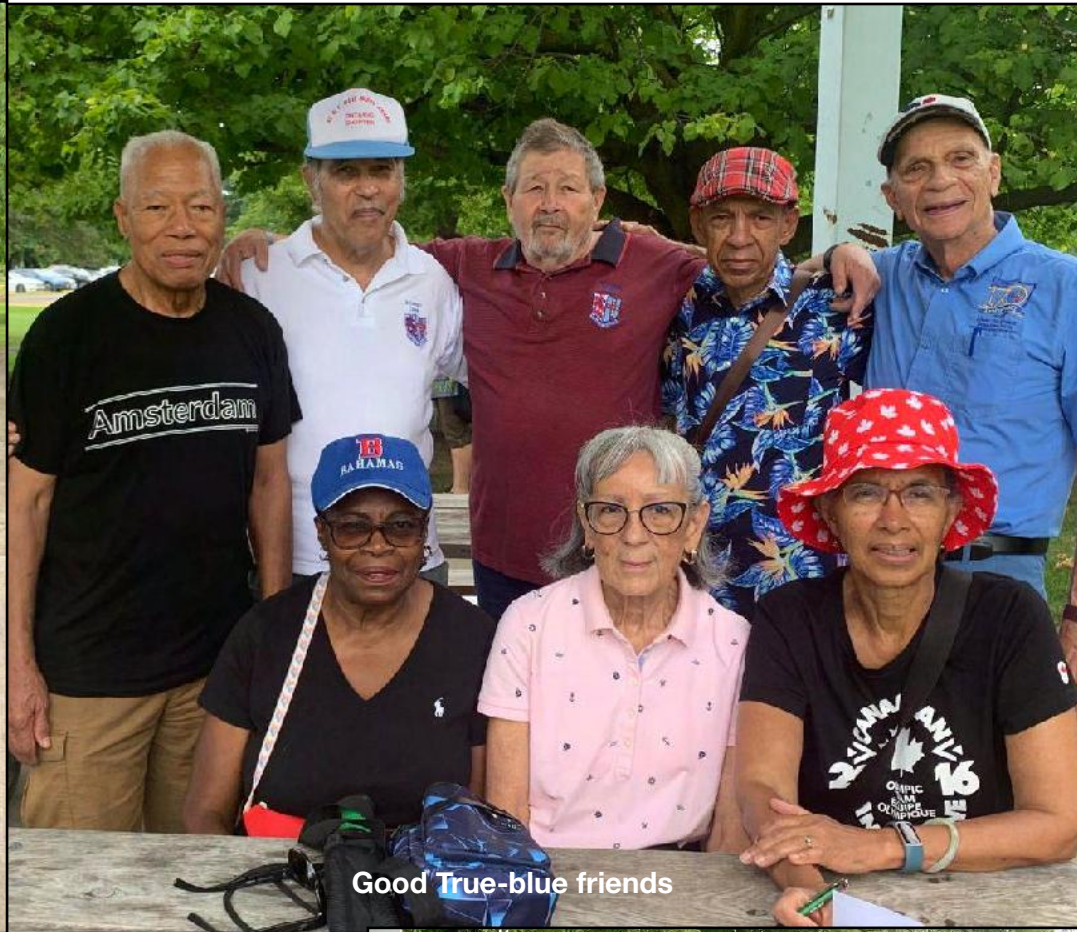
Good True-blue friends